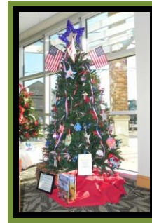
2 nd Place Tree Agapeland Preschool Grand Old Flag by B. Schwaeber and B. Nussbaum